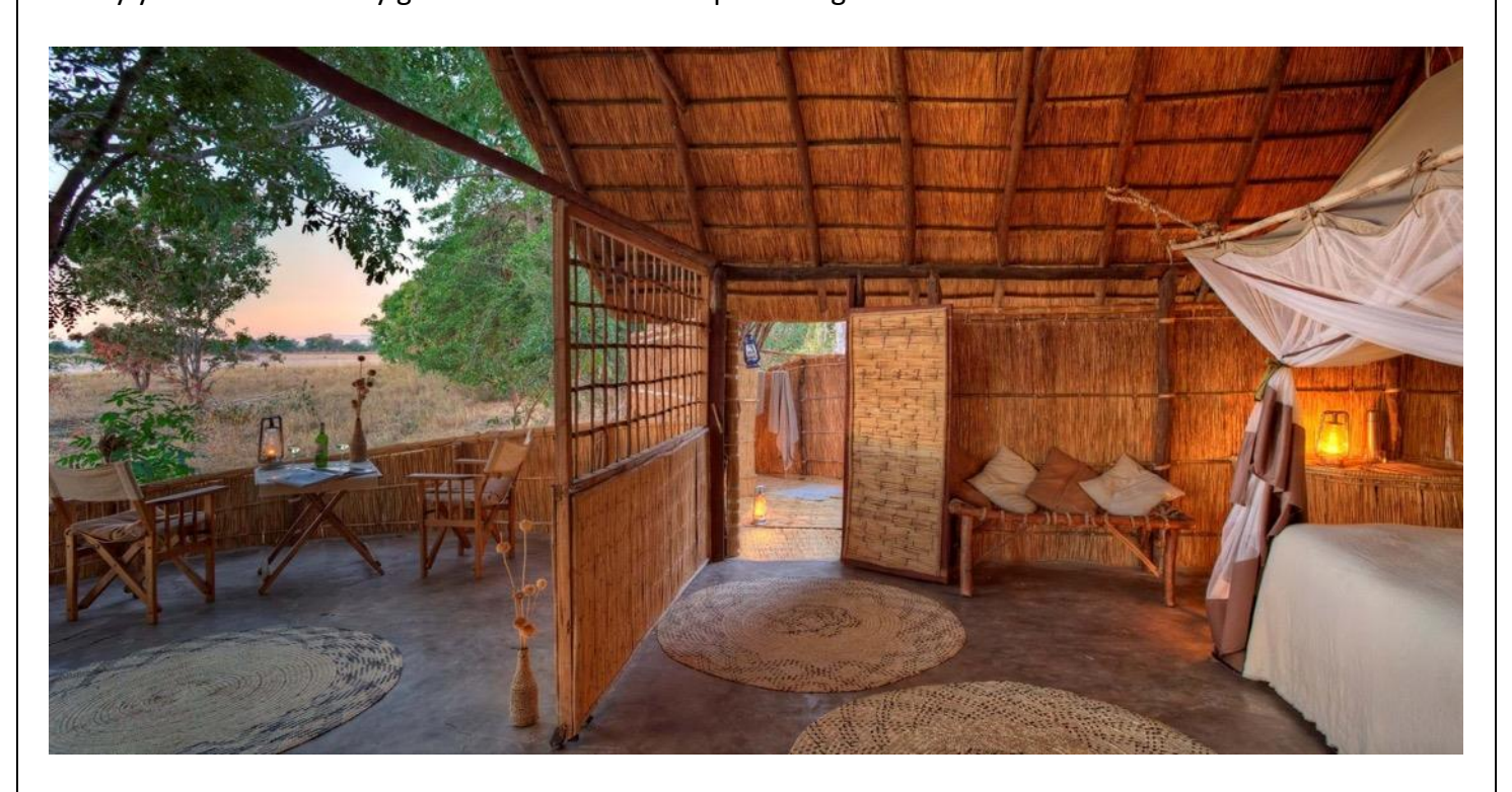
DAY SIX Today you will transfer by game drive to Luwi Camp for 2 nights on an all-inclusive basis.

Situated deep in the national park on the ephemeral Luwi River, Luwi is wonderfully remote, with no other camps or people for miles around. Tranquillity envelops this camp, creating a wilderness haven that allows guests to reconnect with nature in a meaningful way.