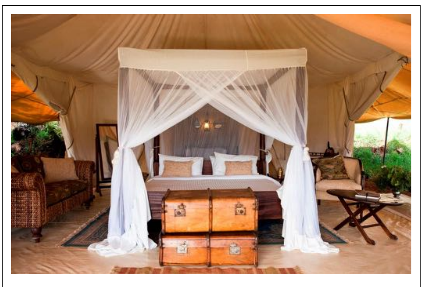
Day 10 - Sands At Nomad Diani Beach

Today you will be transferred to the airstrip in time for you flight to the coast - on arrival you will be met by Sands at Nomad and transferred to the lodge for 4 nights on a full board basis .