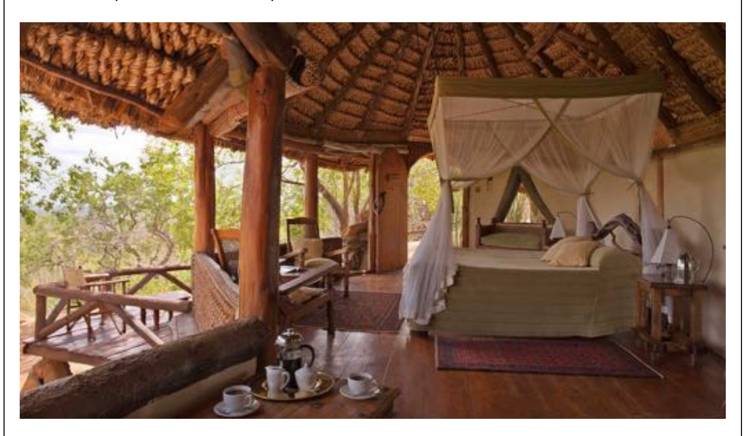
Day 4 – Lewa Safari Camp – Lewa Wildlife Conservancy

A birders paradise, Meru boasts over 400 species, as well surprising botanical treasures including the giant baobab tree and rare paper bark Albitzia. Our guides know the territory of the Meru lions and leopards, but also in a habitat so diverse, they know the medicinal properties of the unusual plants, are keen birders, and can show you the home of the tiny naked mole rat!