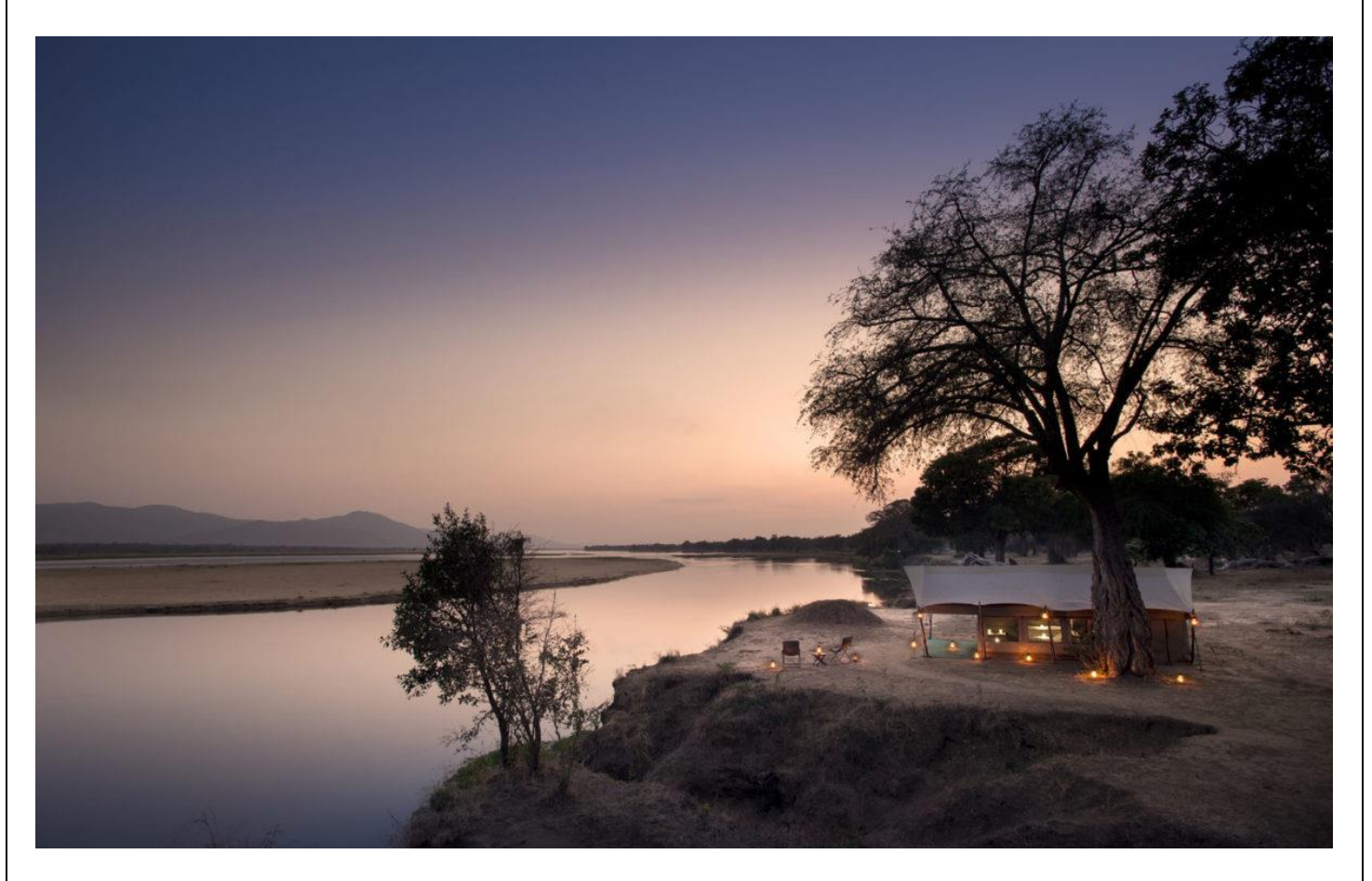
The camp is right next to the Zambezi River and offers adventurous canoeing safaris, tracking game along the shorelines by foot, fishing for tiger fish and game drives in open 4 x 4 along the flood plains and into the heart of the Mana Pools UNESCO World Heritage Site.

Zambezi Expeditions has one of the most magnificent settings in Zimbabwe's Mana Pools National Park. Comfortable yet classic – this simple tented camp sits in the shade of winter thorn and ebony trees. Each tent has en suite bathroom facilities with hot bucket showers and the main area has comfortable seating, a dining area and charging facilities for your cameras and devices.