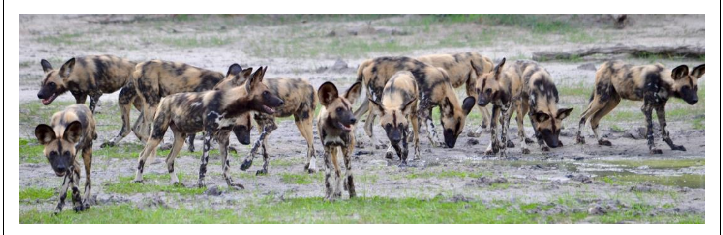
Wildlife in the area offers large concentrations of buffalo and elephant and predators such as lion, wild dog, leopard and cheetah are often sighted. Greater kudu, Burchell's zebra, impala, warthog and common