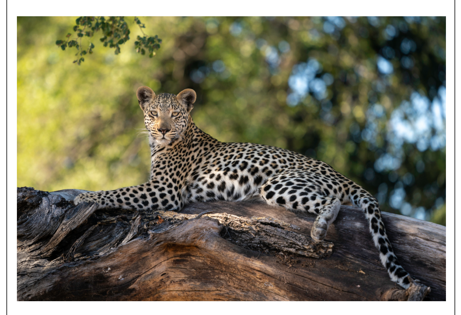
TRACKS SAFARIS - WE GET YOU CLOSER TO AFRICA!

Why not extend your African journey! You can add more nights in South Africa, another desert camp in either Nxai pan or the Central Kalahari Reserve, another camp in the Okavango Delta or enjoy some time in Chobe National Park before heading to Victoria Falls. Alternatively, why not use Victoria Falls as a jumping off point to explore Zimbabwe. We have chosen luxurious camps - but we can adapt this itinerary to fit your budget – please ask!