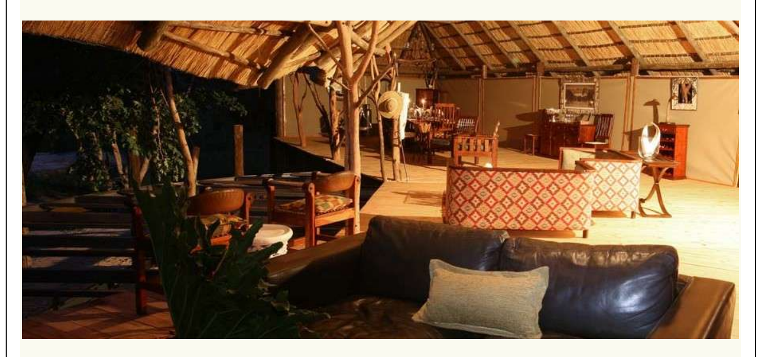
DAY EIGHT – transfer to Victoria Falls – approximately 2 hours – for two nights at the Victoria Falls Hotel.

Khulu Ivory offers guests guided game viewing on our private concession and/or in the National Park and activities on offer are half or full day game drives, night drives, visits to the Painted Dog Conservation Centre, walking safaris, pan/hide sits and game counts.