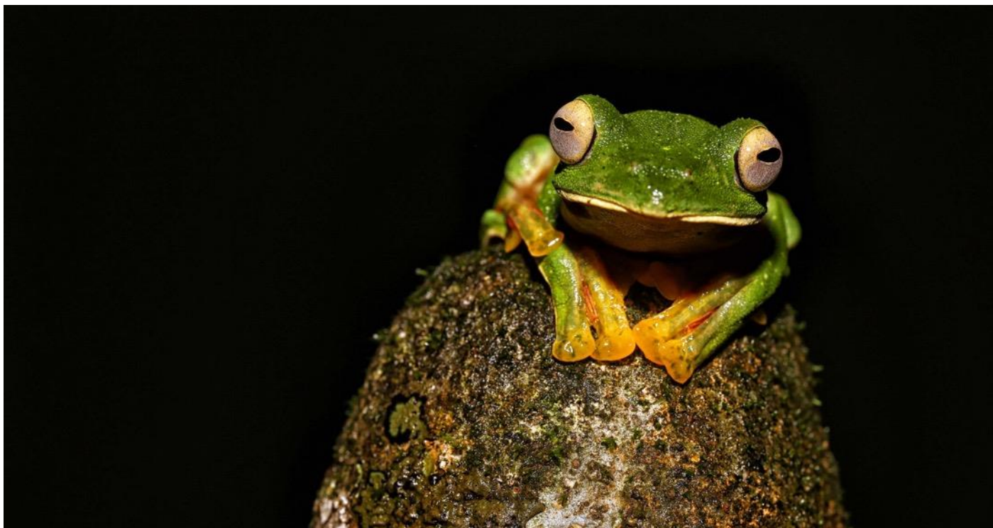
Image: Malabar Gliding Frog