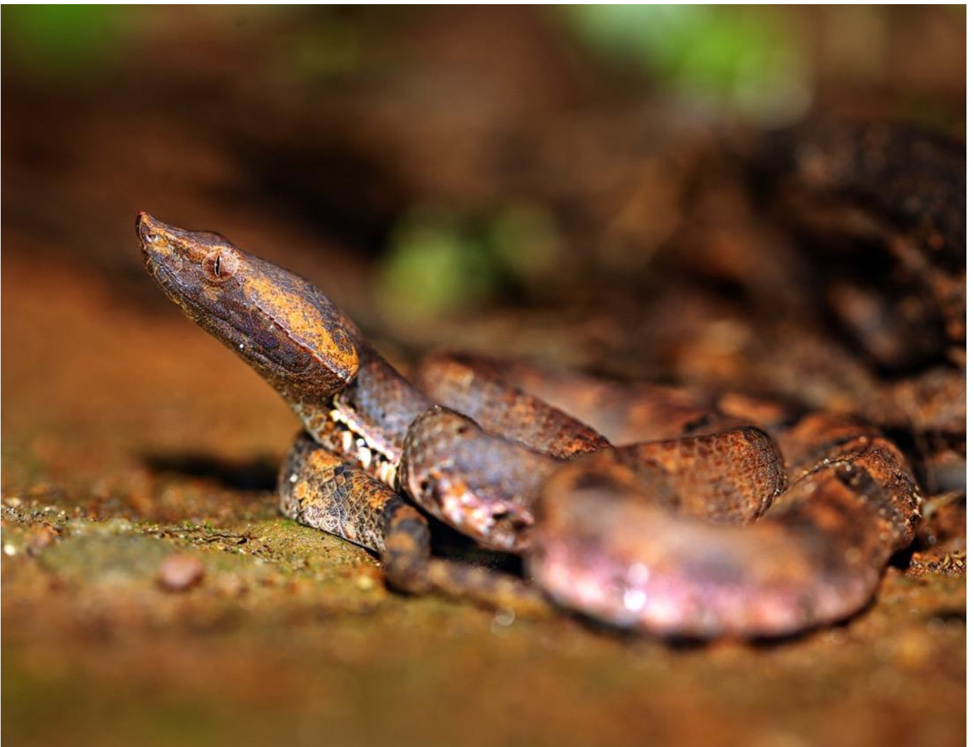
Image: Hump-nosed Pit Viper

Bengaluru – Wayanad – Masinagudi – Kabini - Bengaluru