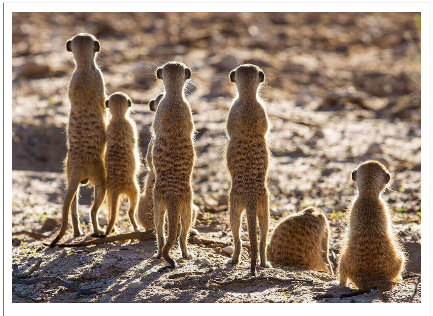
TRACKS SAFARIS - WE GET YOU CLOSER TO AFRICA!