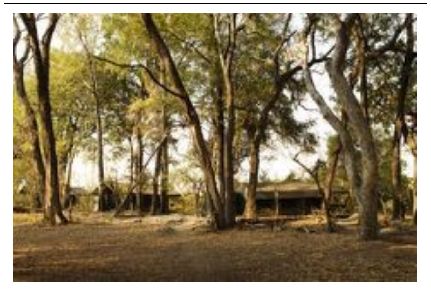
Day Two - Footsteps Across the Okavango Delta

The day begins before sunrise with coffee/tea around the fire, and breakfast before heading out to see what the bush has in store for us.