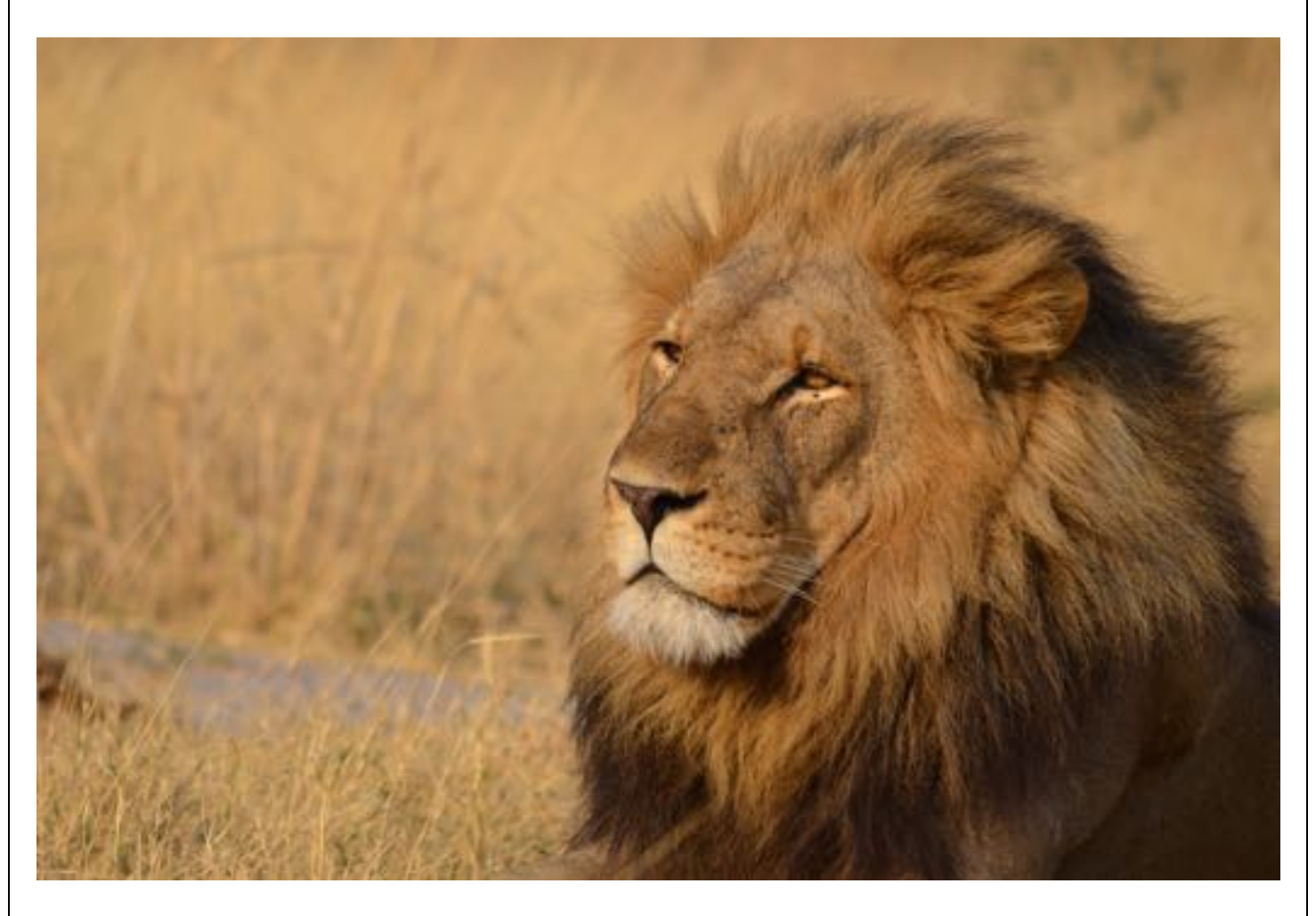
Day One - Footsteps Across the Okavango Delta

On arrival in Maun you will be met by our representative, then board a light aircraft transfer to the Shinde Private concession. The flight is approximately 25 minutes and you will be amazed as the desert transforms to delta before your eyes. At the airstrip you are met by your guides and transfer in a 4x4 safari vehicle to camp. Over a refreshing drink and light lunch, you will be briefed on activities and safety during your stay, then it is time to settle into camp.