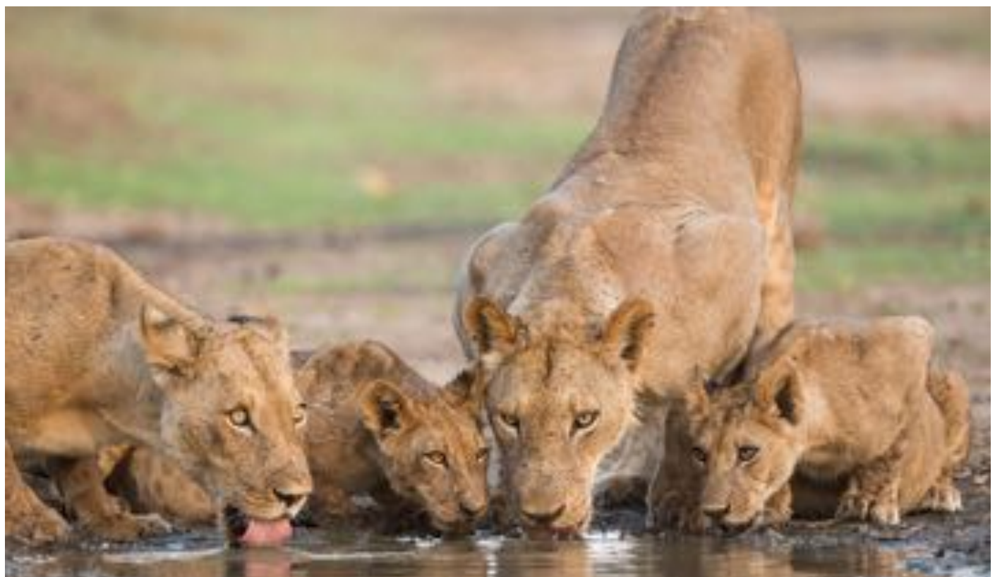
TRACKS SAFARIS - WE GET YOU CLOSER TO AFRICA!