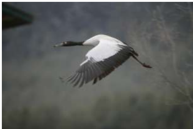
Black Necked Crane

Overnight – Yankhill Resort - All meals included