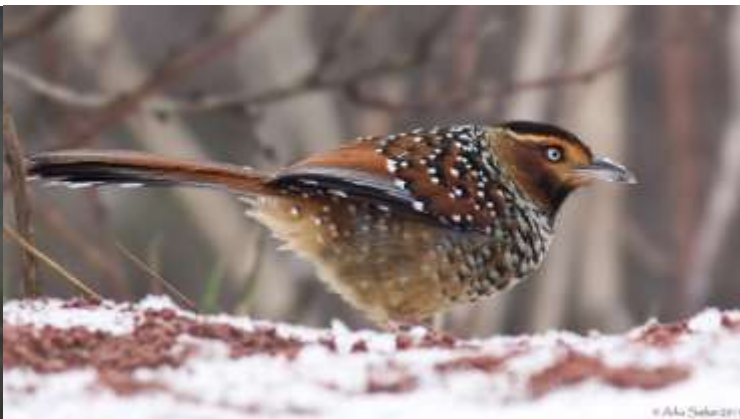
Spotted Laughing Thrush