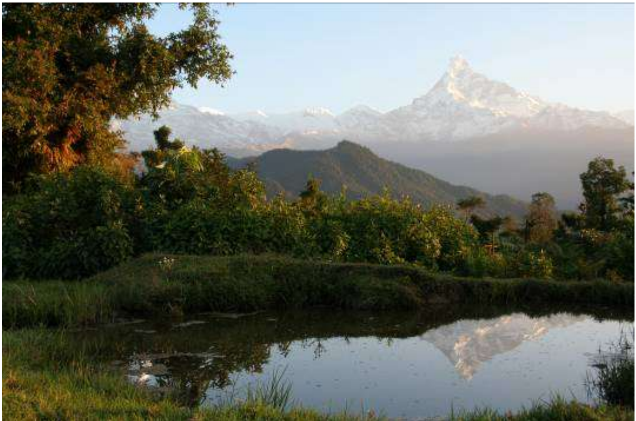
Nepal is famous for three mountains of which one is the Fishtail or Machhapuchare

Overnight – Machan Paradise View Lodge - All meals included