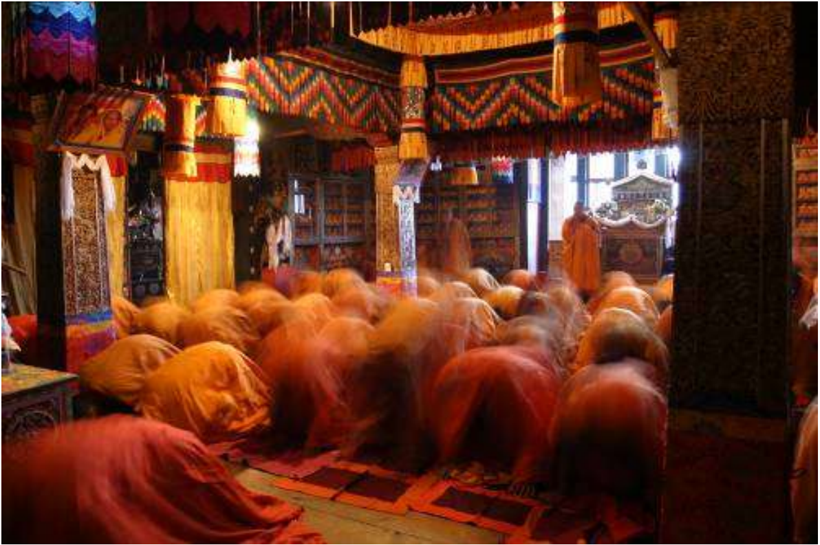
Inside a Dzong