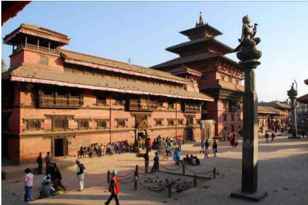
Patan Museum at Patan Darbar

Day 13 Kathmandu – Fly back - you will be driven to the international airport to connect to your flight back home.