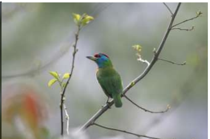
Blue Throated Barbet