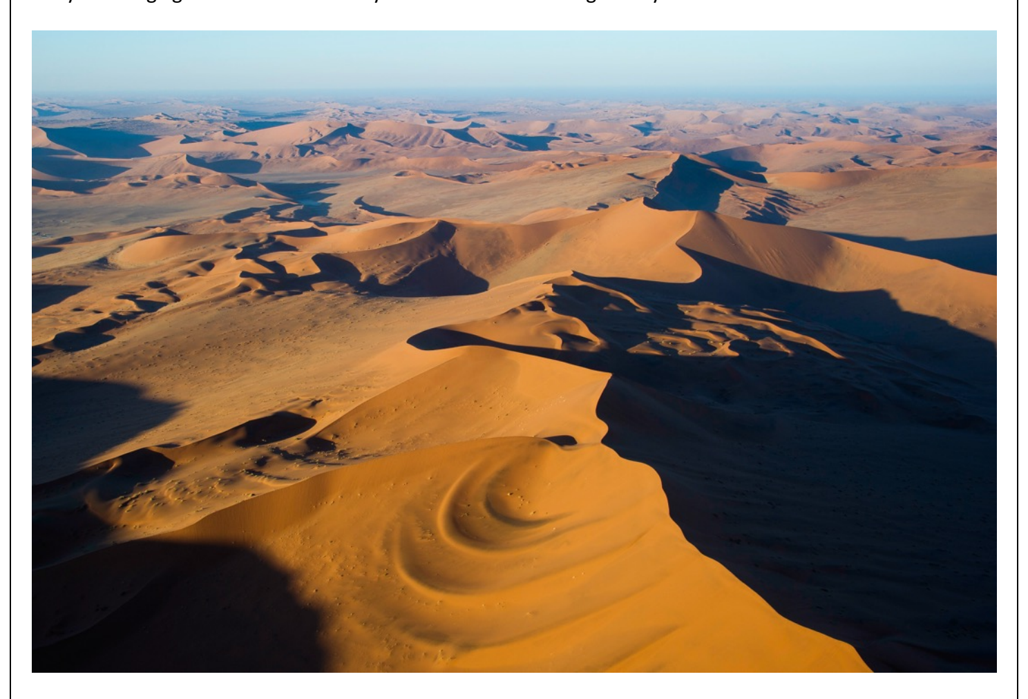
Day 04: Cornerstone Guesthouse, Swakopmund

INSIDER'S TIP: Try your hand at desert photography – whether capturing the red colour of the dunes in the early morning light or the otherworldly tree skeletons standing starkly across the floor of Dead Vlei.