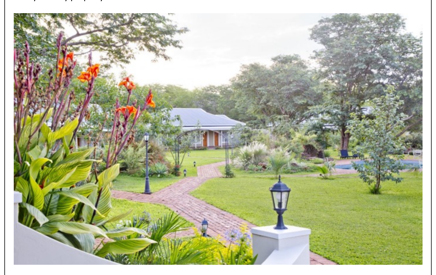
Day 13: African Bush Camps Linyanti Bush Camp

The heart of Pioneers Lodge is the centrally located main area, with a stylish and comfortable lounge and an inside dining room. Guests also have the option of relaxing and dining on the spacious terrace overlooking lush gardens. There is a large bar area which serves a variety of cold and hot beverages, including local craft beer made from Zambezi water. For the modern traveller, Wi-Fi is available throughout the lodge. Well placed in the lush gardens are two swimming pools, a day spa, and TV Room. Pioneers is a family friendly property.