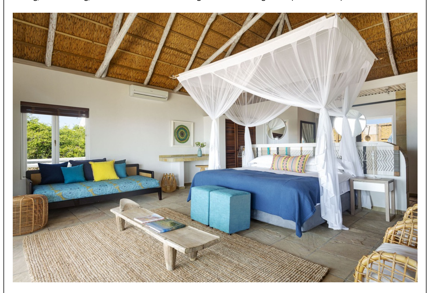
Day 27: End of Itinerary

swimming pool, a trading store and a dive centre. Guests can enjoy island hopping by speedboat, deep sea fishing, scuba diving, a sunset dhow cruise and a guided snorkelling safari (at extra cost).