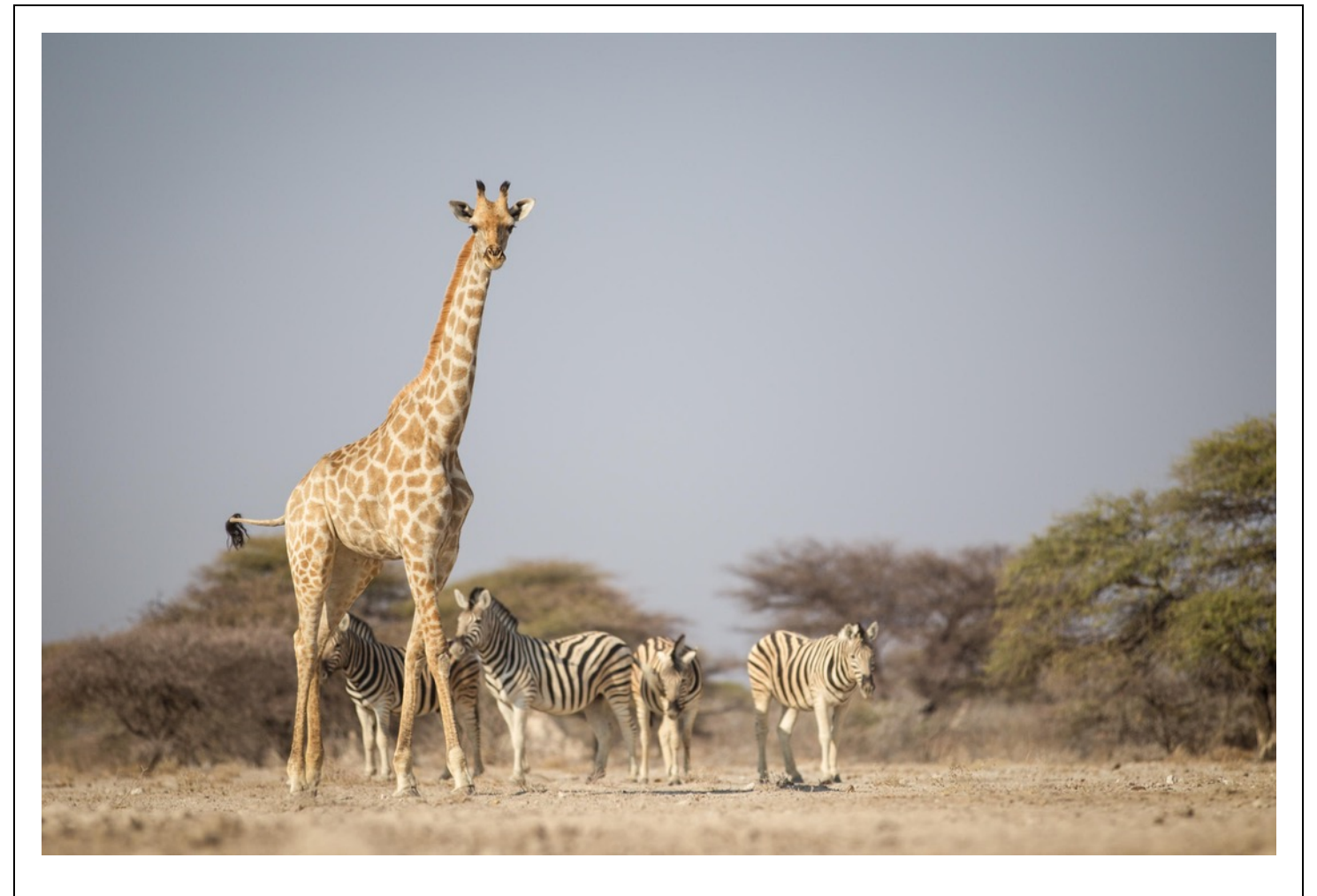
Day 10: The Weinberg Windhoek, Windhoek

Self-drive back to Windhoek for one night at The Weinberg with the following inclusions: Breakfast, complimentary WIFI, complimentary parking, Bed Levy and VAT.